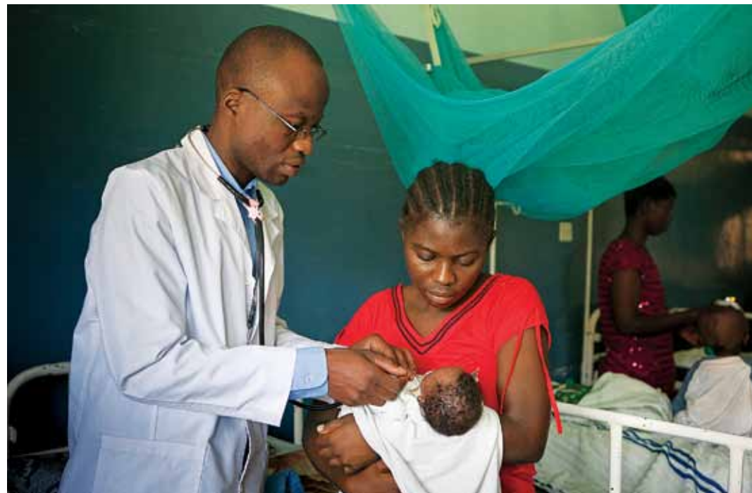
A doctor administers Novartis's anti malaria medication to an infant at Michelle Obama Children's Hospital in Kenya.