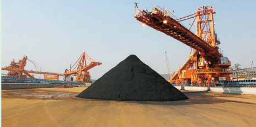
Coal piles up in the Moatize mine, in the province of Tete, Mozambique.

Vale is a leading mining company, and our work goes far beyond mining. We care about the African people and contribute to the economic and social development of the regions where we are present. In Mozambique, Vale has recently launched operations at the Moatize Coal Mine in the Tete province. A major addition to the local and national economy, Vale's presence in Tete brings diverse social investments to the area and is driven by a workforce comprised of 85% Mozambicans. In Zambia, Vale is developing copper projects, where we sponsor the Millenium Village, a poverty eradication program that's helping the country reach the Millenium Development Goals. And we do all of this by looking ahead, in order to bring a better future for Africa.