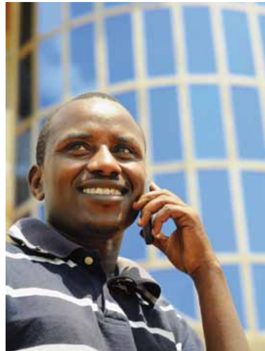
Staying connected: Cellphone usage is helping African communities improve everything—from banking to health care.

reserves, the country's mining industry has been largely overlooked.