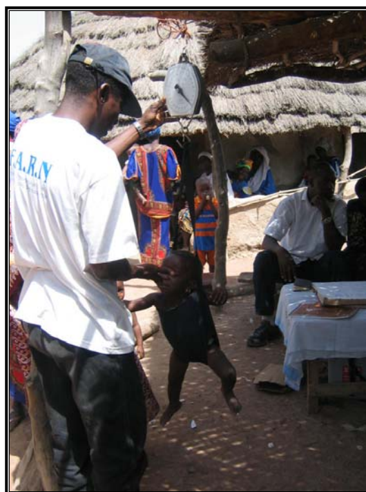
Project data show a clear pattern of an increased number of children weighed, monitored, and rehabilitated under Hearth, which is unquestionably a great success story for the project.

Data were also collected on the nutritional status and changes in weight before and after Hearth for children who participated in the program (Figures 1 and 2). These data clearly show that many children enjoyed improved nutrition and positive weight gain as a result of participating in Hearth. Furthermore, Figures 1 and 2 show that the behavioral and health changes that occurred due to participation in Hearth have been sustainable. Children continued to gain weight