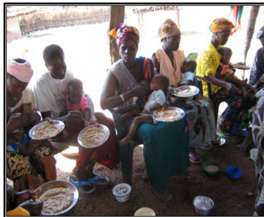
“Each Hearth session consists of 12 days during which the model mother or Mama Lumiere (ML) becomes a peer educator to lead other women in practices she has found to be successful in her own home setting.”

The volunteer community health agents are key to the smooth functioning of the Hearth program in the villages. These volunteers are from the communities and are trained by Africare to identify malnourished children through the monthly weighing sessions in each individual village, give nutritional or health education talks, and distribute medications and micronutrients such as Vitamin A. They also have a reference sheet that is often completed following a home visit, to refer both ill children and adults to the closest health center and some agents even accompany these ill individuals (who include severely malnourished children) to the health center. There were 150 volunteer community health agents in Dinguiraye and 99 in Dabola; one male and one female per community who were chosen by their communities. The extent of their role can vary from village to village and depends on the individual's level of motivation, since these individuals are unpaid.