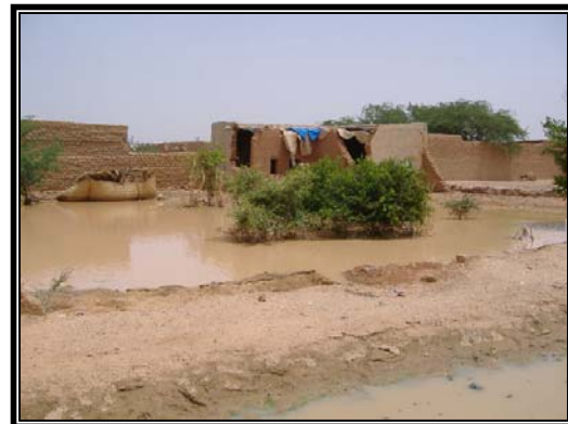
The CEWS-ER was functional almost immediately and shortened the time it took to respond to the 2003 flooding.

Under the new project, ATFSI will continue to train and retrain project staff and community leaders both in Agadez, Tahoua, and the Filingue area (in the province of Tillaberi) where the project has added new villages. The project is also planning to help the communal and department level officials develop coordinating committees that are mandated by the Government of Niger's own early warning efforts. Both the party and leaders in the national system feel that there are strong complementarities between the two systems in the production and analysis of information, as well as in execution of appropriate responses to shocks and crisis. This type of community-level collaboration with the regional representatives of this national system is critical to sustainability.