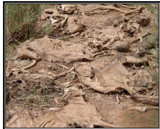
The General Assembly estimated a total of 1,473 head of livestock died due to the 2005 crisis in Gofat (Box 6).

2005 Drought and Locust Infestation. In 2005, the FSIN/Africare project and other regional and national partners involved in the Agadez region were alerted to a large impending slow-onset food security crisis by the indicators in the CEWS-ER tracking system of the 10 pilot villages. The crisis was caused by a combination of rainfall shortages and a massive locust infestation (between August and October 2004) (Rhili 2005). In Agadez the situation was made worse by a price collapse of the major irrigated vegetable crops—onions and tomatoes—during the dry season, which dangerously reduced local peoples' buying power (Rhili 2005). The CEWS-ER was so effective that this warning predicted the crisis five months before it hit. Once the alert was sounded, the project worked with local communities in the entire area (not just the 10 pilot villages) to develop ten new cereal banks, banks for animal feed and agricultural inputs, and 1500 tons of wheat for Food for Work (FFW) projects. Given the massive need (Box 6) and the aim of avoiding widespread displacement to the villages in which Africare worked, the Food for Work component of the